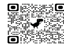
North New Hope