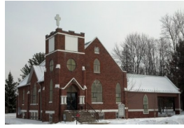
845 Cty Rd T, Amherst Jct.