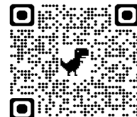
North New Hope