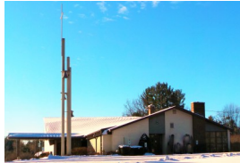
253 S Main St, Rosholt

NONPROFIT ORGANIZATION U.S. POSTAGE PAID ROSHOLT WI PERMIT NO.2