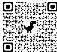
North New Hope

7 They will not be afraid of any evil rumors; their heart is steadfast, trusting in the LORD.