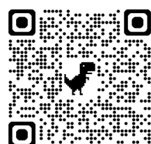
North New Hope