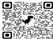
North New Hope