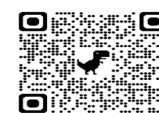
North New Hope